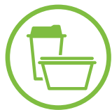
Paper cups & bowls