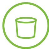
Paper chip & sauce cups