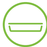
Paper sushi trays