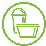
Clear cups & bowls