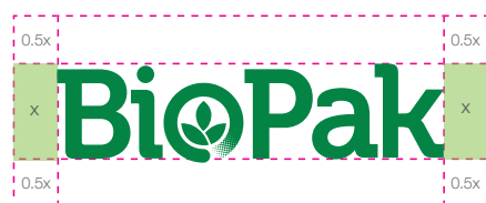
BioPak logo clear space

BioPak donates 5% of profits to positive change.