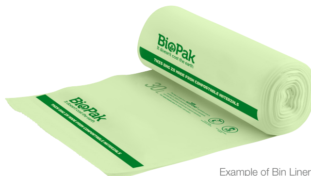
Example of Bin Liner